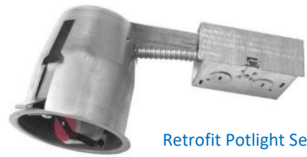
Retrofit Potlight Series

Use with 4" LED Downlights Sold Separately