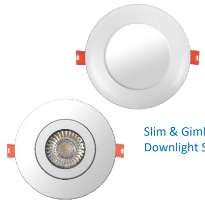
Slim & Gimbal Downlight Series