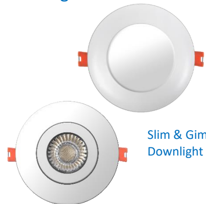
Slim & Gimbal Downlight Series