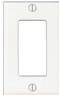
PEDP221M White Finish