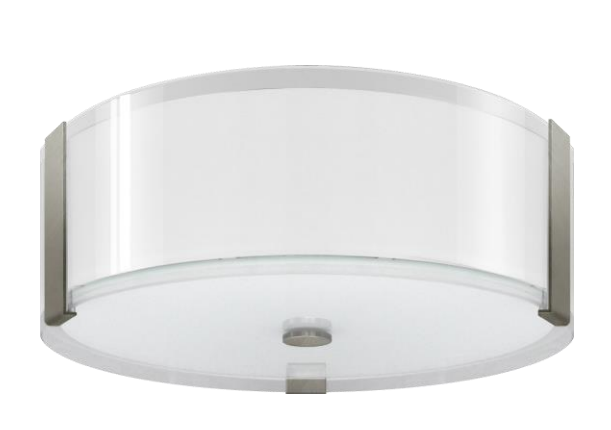
FIXTURE FULLY ASSEMBLED