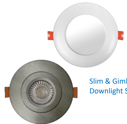
Slim & Gimbal Downlight Series