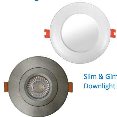
Slim & Gimbal Downlight Series