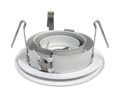
View of Clips