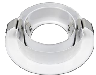
View of Clips