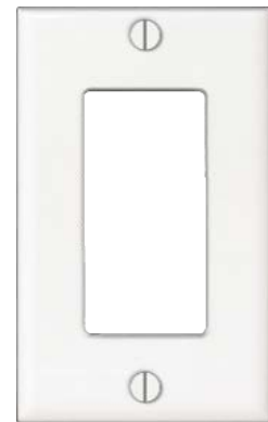
PEDP221M White Finish