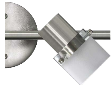
Front View with Swivel