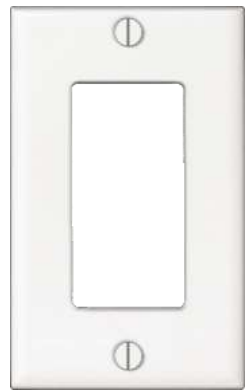
PEDP221M White Finish