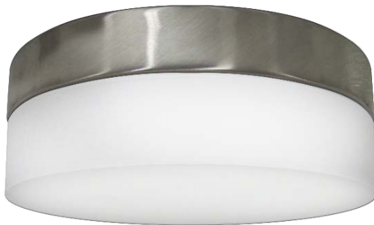
Brushed Nickel Finish